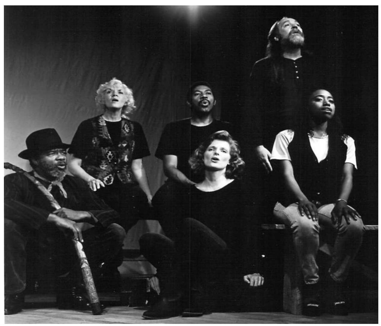
In response to increasing KKK activity in the 1980s, Roadside and Junebug Productions began the Junebug/Jack collaboration, performing for each other's home audiences – one predominately white, the other black, both low to moderate income. This article is part of the Creating Place project. View the full multimedia collection here.