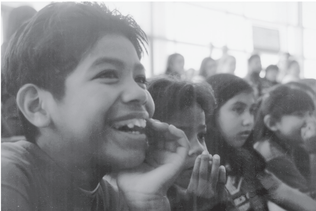
18. Students from Sierra Vista Elementary School watch a performance at Grady Gammage Auditorium, 11 April 1999.

Like many adolescent organizations, we need to think creatively about the management, administration, and governance practices that support our artistic work. The AFP has always focused its energies and resources on projects, and now we're in the position of increasing our organizational capacity to support the work at new and more demanding levels. We're learning how to take advantage of new technology in our communication strategies. We're re-defining our concept and expectations of documentation. We're adding staff, and utilizing interns from the Antioch College Cooperative Education Pro-