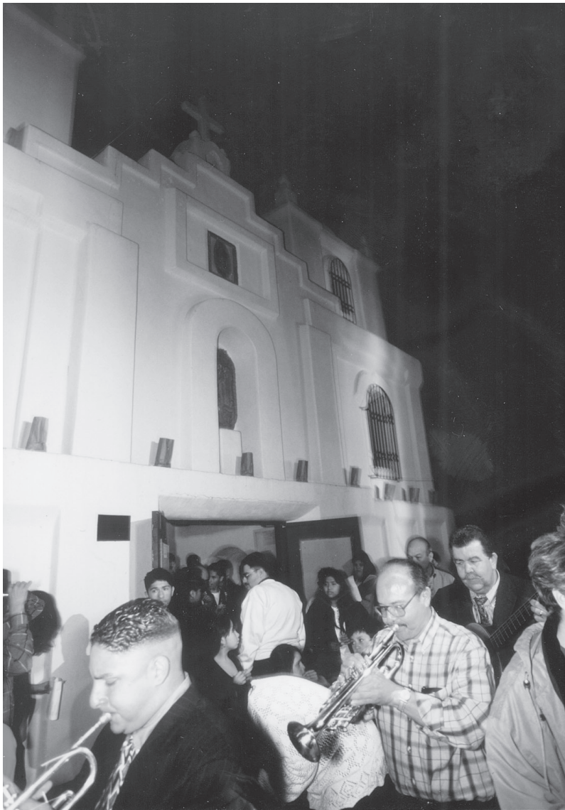
12. In front of Our Lady of Guadalupe Church, neighborhood musicians lead the posada following the community performance of La Pastorela.