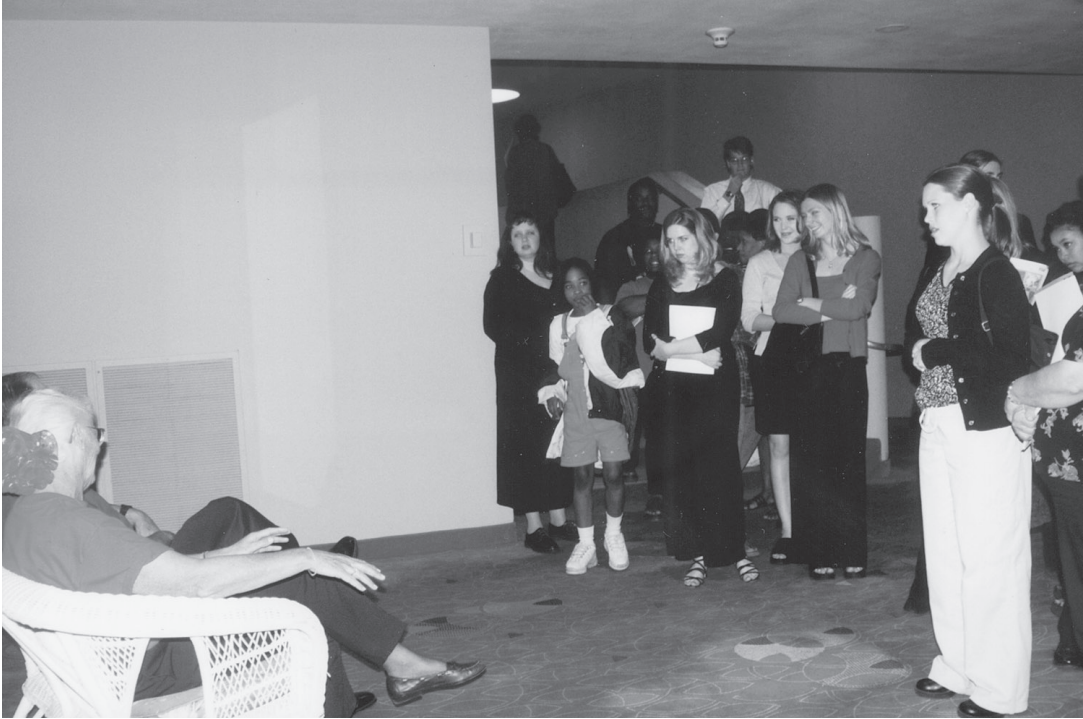
13. Audience members listen to members of The Entertainers , an amateur performance group in Phoenix's Ahwatukee retirement community along The Gammage Tour.

cuss differences and similarities in communicating with the diverse communities she worked with in the project: