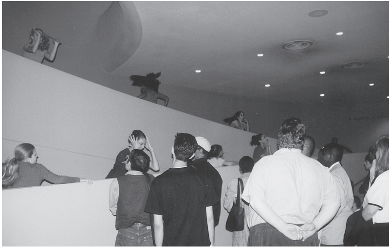
17. ASU Dance Arizona Repertory Theatre in The Gammage Tour: The Other Side of the Mountain, Grady Gammage Auditorium.

project's resources. Like the identification of goals and the development of project structure or performances, resource management needs to be a collaborative process with all the participants at the table.