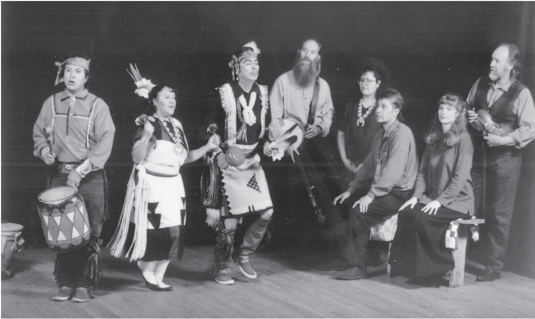
3. Artists of Idiwanan An Chawe and Roadside Theater in their play Corn Mountain/Pine Mountain , performed at the Empty Space Theater , Tempe, Arizona, 14 February 1998, and at Grady Gammage Auditorium in Phoenix on 11 April 1999.

an essential participant in the self-discovery of their own rural place, the coal fields of the Cumberland Plateau, where they are part of the legendary Appalshop cultural center. Roadside 's original musical theatre works are drawn from the history, character, and social struggles of the people of Appalachia. Their goals, like Appalshop's, were the perpetuation of cultural heritage, and collaboration with the community to create a contemporary cultural identity linked to progressive social change. The Plateau's—and the central Appalachian region's—relationship with their artists is a grassroots partnership based in ongoing dialogue via live performance, film, video, music recording, printed word, and a continuously broadcasting radio station. 2