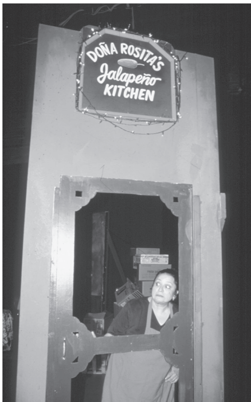
6. El Teatro de la Esperanza's production of Doña Rosita's Jalapeño Kitchen at Grady Gammage Auditorium, March 1998.

For Untold Stories , Idiwanan An Chawe worked at St. Peter Indian Mission School, a Catholic school on the Gila River Reservation, serving the Pima Indian tribe. The Zuni artists included young teenaged dancers who performed their traditional dances for