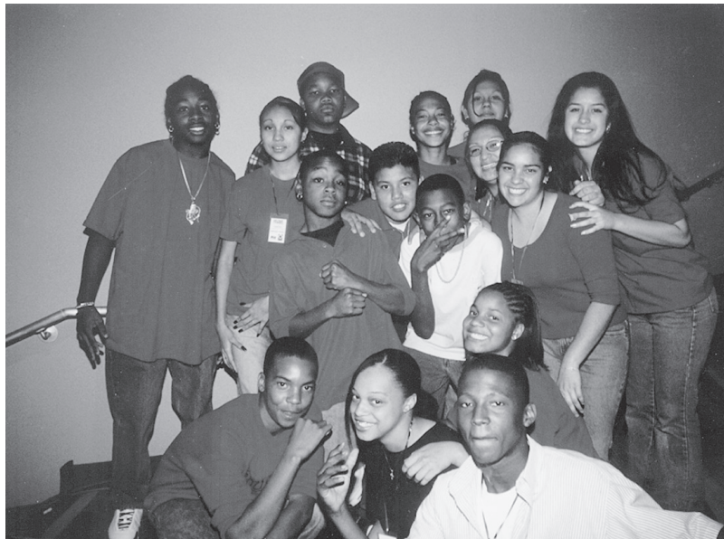
5. Students from Sierra Vista Elementary School who participated in the Untold Stories festival, Grady Gammage Auditorium.