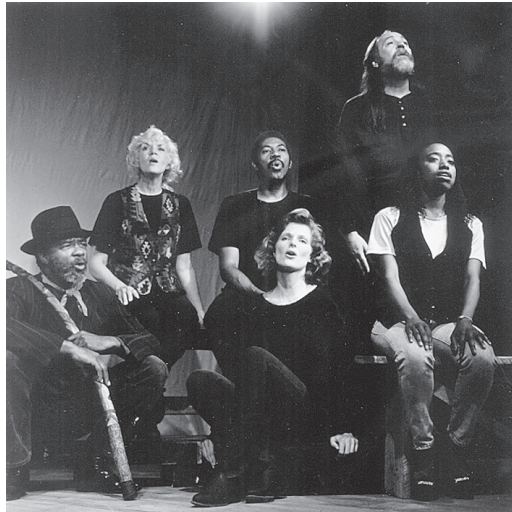
2. Artists of Junebug Productions and Roadside Theater in their play Junebug/Jack , performed at Grady Gammage Auditorium, Phoenix, 9 April 1999.

This deep thinking about how artists move in the world also arose from some very practical consideration for these small artistic companies, for instance, Roadside Theater from Appalachian Kentucky. Roadside had become