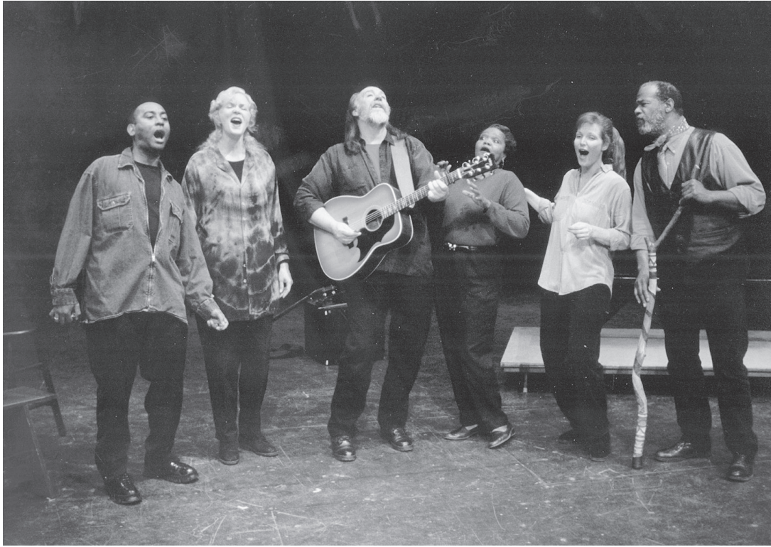
16. Members of Roadside Theater and Junebug Productions in Junebug/Jack, a piece created over the past 10 years with the hope of sharing each other's audiences—one predominantly white, the other predominantly black—both economically hard-pressed.