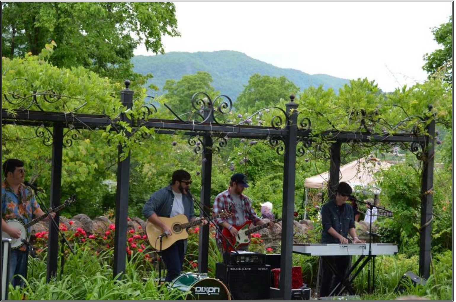
Gathering with Friends and Family Every Year!