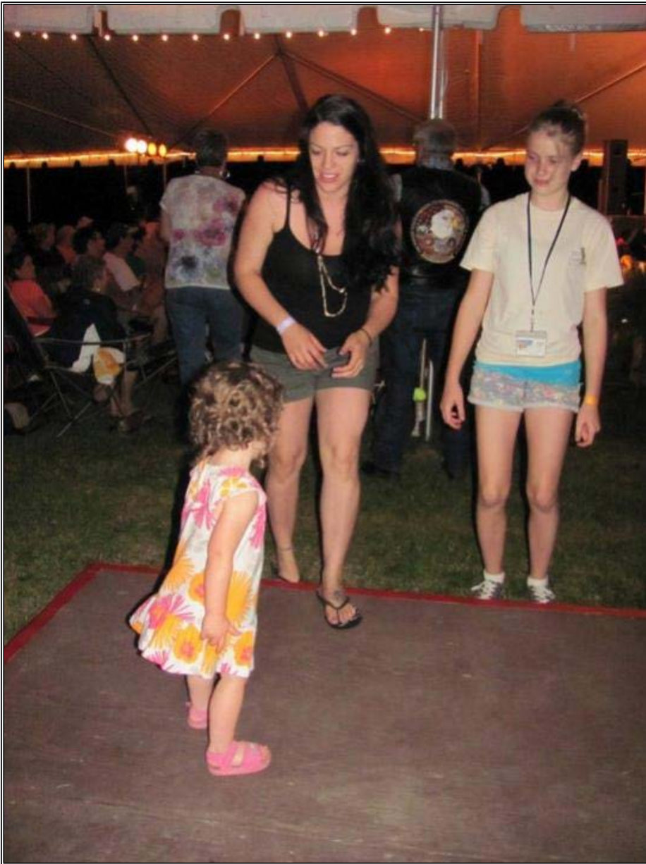
The Whitetop Mountain Band: