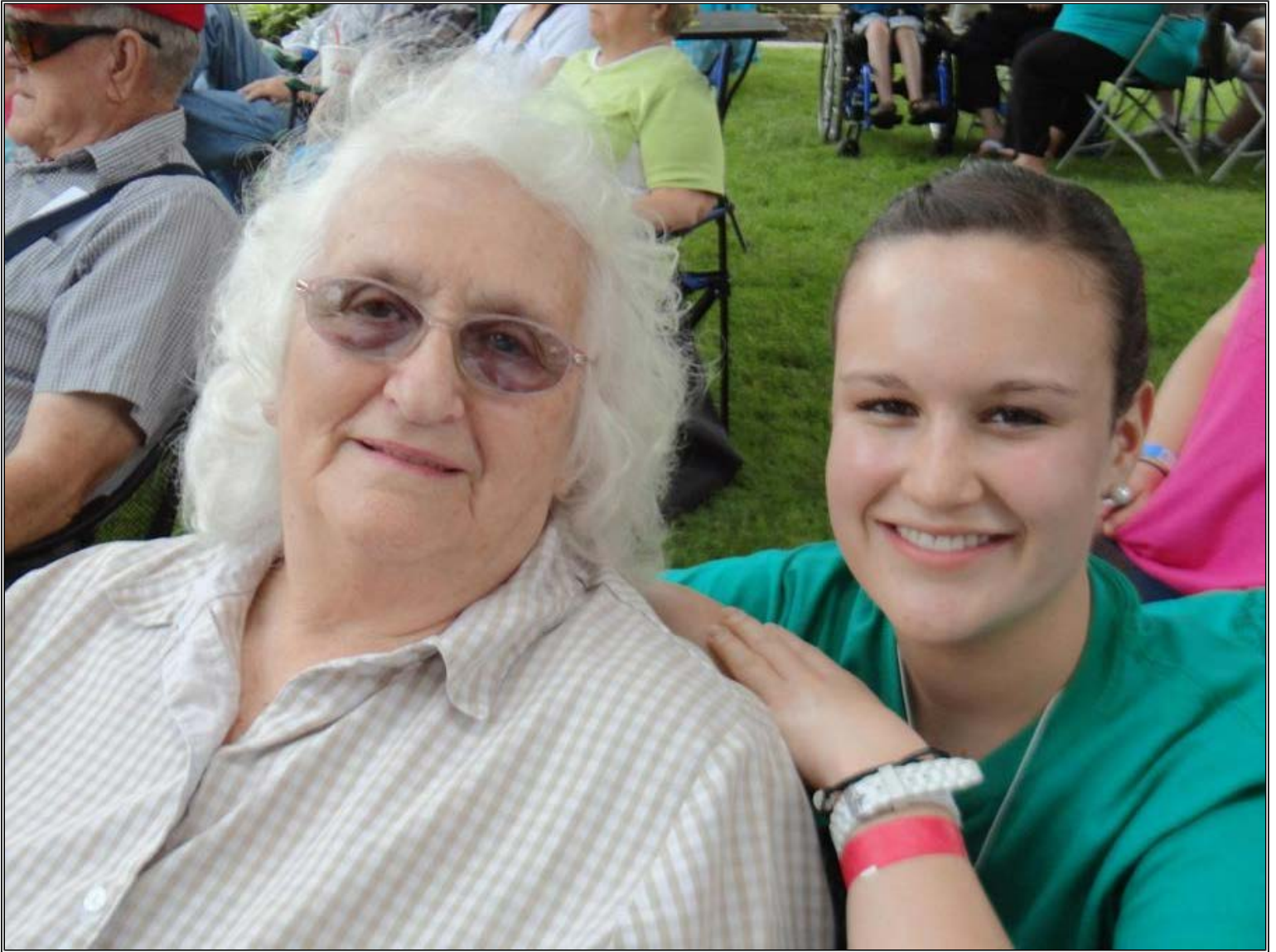
The Gathering in the Gap is always truly a 'gathering' for me. Especially after I went to college ~6 hours from home, the gathering serves as a day for me to catch up with the locals of Big Stone Gap, VA as well as my family.