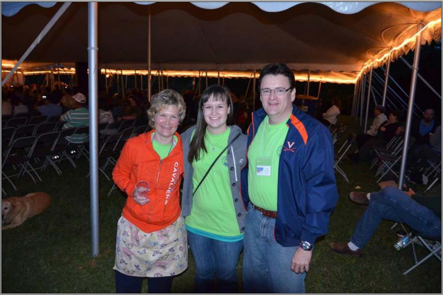
And to give you a glimpse of the festival from previous years: