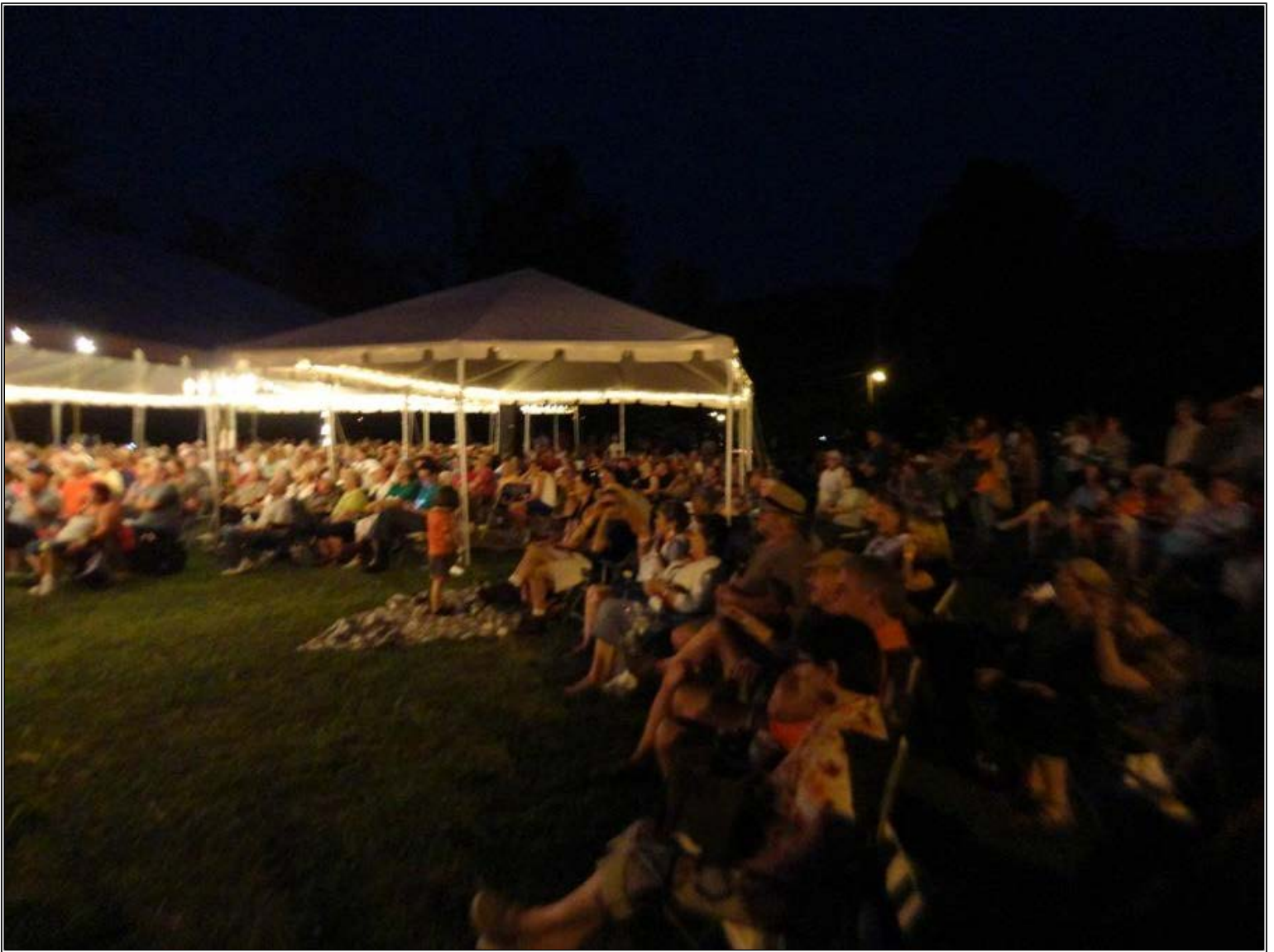
Performing My Forensics Competition Storytelling Piece at the Children's Tent: