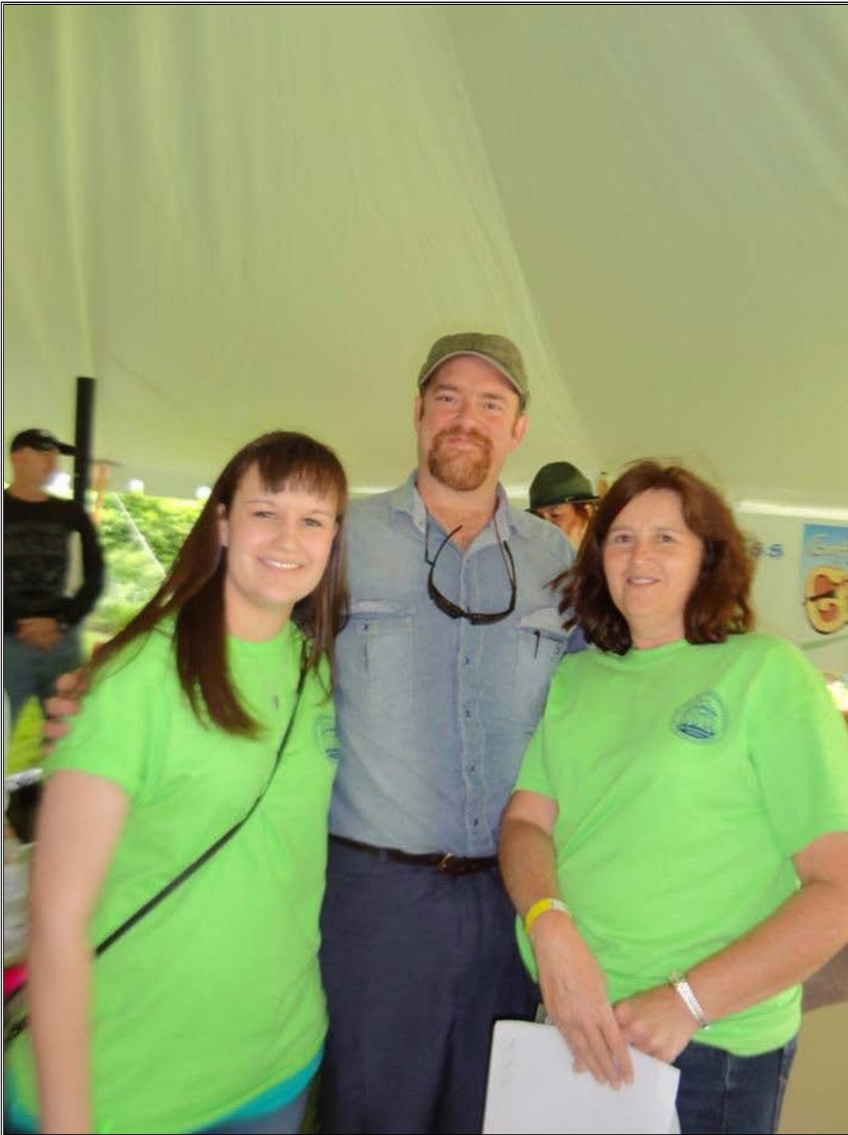
My mother and father both work very hard as Friends of the Museum Volunteers each year at the festival. My mother is one of the cooks for the musicians of the festival. Dad helps with the admissions gate or wherever he is needed.