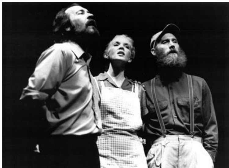
Roadside Theater performs South of the Mountain