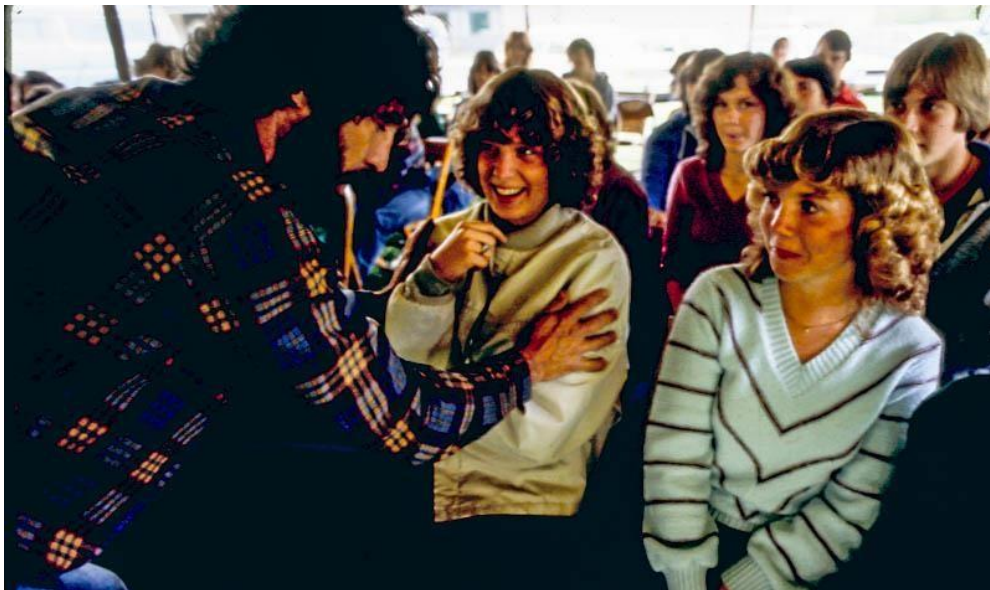
Roadside Theater performs a traditional Jack tale

The group that undertook this work took the name Roadside Theater and began offering performances wherever the group’s actors hung their coats. Area schools usually could afford between $50 and $75 for an assembly performance, and $3 was the standard adult admission to an evening Roadside show in a community center or church hall. Appalachian people of all ages loved what the company was doing—there just was not enough local money to support it.