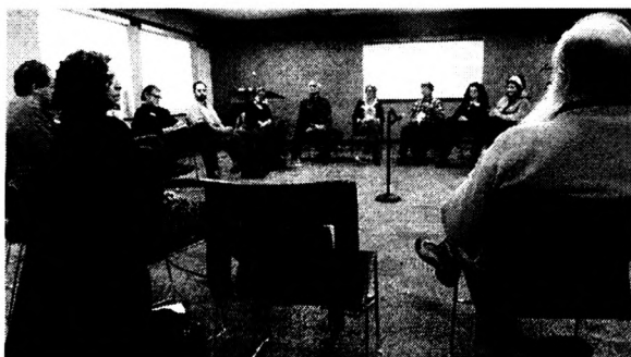
FIGURE 7.3 Roadside Theater conducts a story circle during a residency at the University of Richmond, February 20, 2013

moves around the circle, one may pass if not ready to share, for the opportunity to speak will come around again.