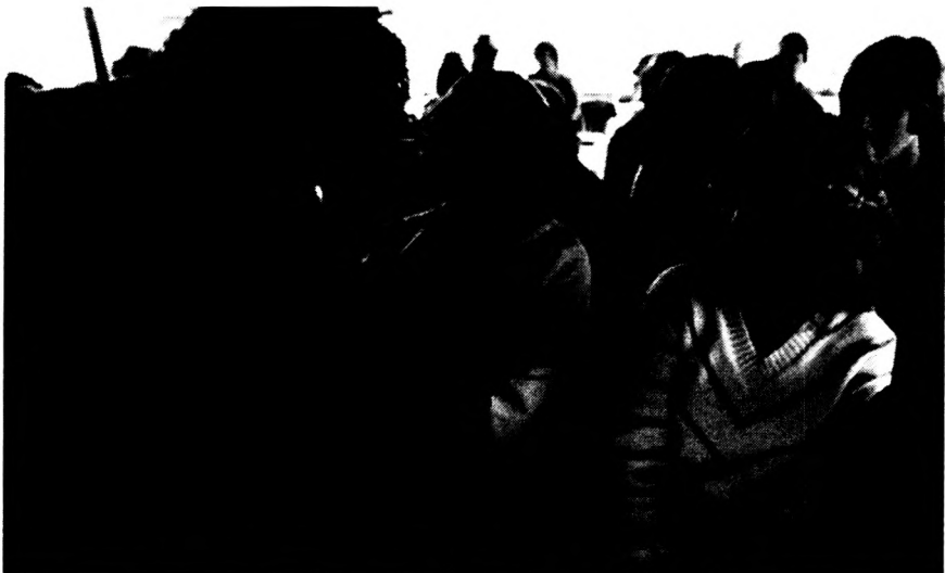
FIGURE 7.1 Roadside Theater artists perform a traditional Jack tale

With these questions in mind, a group of young Appalachian musicians and storytellers started rehearsing traditional Jack and Mutsmeg (the female version of Jack) tales and performing them in schools and local community centers in central Appalachia. During a three-year (1916–1918) visit to the United States, English ethnomusicologist Cecil Sharp had observed that these centuries-old archetypal stories and ballads were more intact in Appalachian communities than they were in the British Isles, where they originated (Yates, 1999). 1 In their spirited retellings, the Roadside actors spontaneously traded characters, batting the old stories' lines back and forth, and generally “cutting a big shine.” Upon ending a tale like Jack and the Heifer Hide , with its rousing shared finale, “And the last time I went down to see Jack, he was a-doin’ well,” the performers would