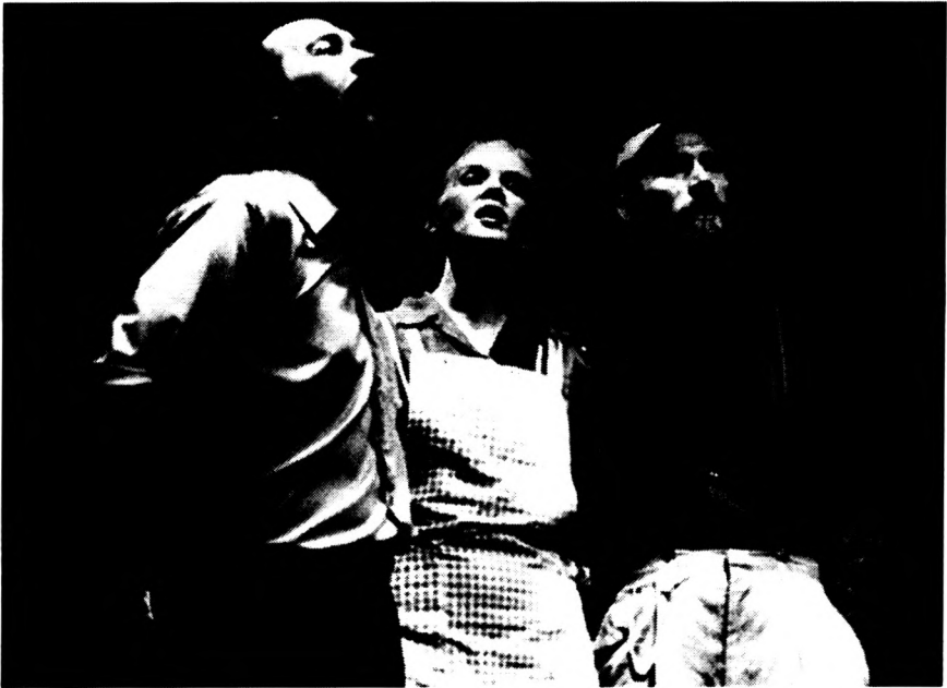
FIGURE 7.6 Roadside Theater performs South of the Mountain

The year 2013 marked the fiftieth anniversary of the FST and was the occasion for another FST reunion in New Orleans. Artists and activists of different ages and backgrounds joined with civil rights veterans who often had put their lives on the line for freedom in the 1960s. The commemoration, again organized by O'Neal and FST's organizational successor Junebug Productions, made the author think about what a twenty-first-century democratic theater might look like and the role community cultural development could play in such a movement. Those who understand power understand the influence of culture and its devised expression, art. They understand that those who control the means of cultural production control the story a community or nation tells itself. 13 Roadside's CCD practice seeks to unmask power so that it may be shared in service to the ideal of a cultural democracy in which all individuals, their communities, and their cultures have an equal opportunity to develop—and inevitably to cross-pollinate.