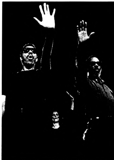
FIGURE 7.4 Junebug Productions and Roadside Theater artists performs Junebug/Jack

A cross-section of the entire community was present when shows opened as a result of the engagement of the chorus and the various communities from which its members came. Friends and family of choir members came to see the play. In addition, because the performances enabled everyone to feel confident about his or her traditions, audience members became eager to witness and to learn more about the other ways of life on offer: to experience how the African American people sang, or how the white people sang, or what inflections young people brought to the song.