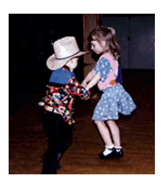
A For Arts residency activity

There were differences in the way For Arts and Roadside Theater viewed ACC's role in the project. For Arts perceived ACC's role as a minor one -- acting as a kind of agent, brokering dates and budgets. This was their experience, as an arts presenter, with agents with whom they annually negotiated contracts for a season of touring performances. Some For Arts board members did not want to pay ACC for work that went beyond this agent routine. Roadside, on the other hand, viewed ACC as a full partner with a key role -- project producer and administrator. Roadside's ten-year experience of conducting multi-year community residencies confirmed